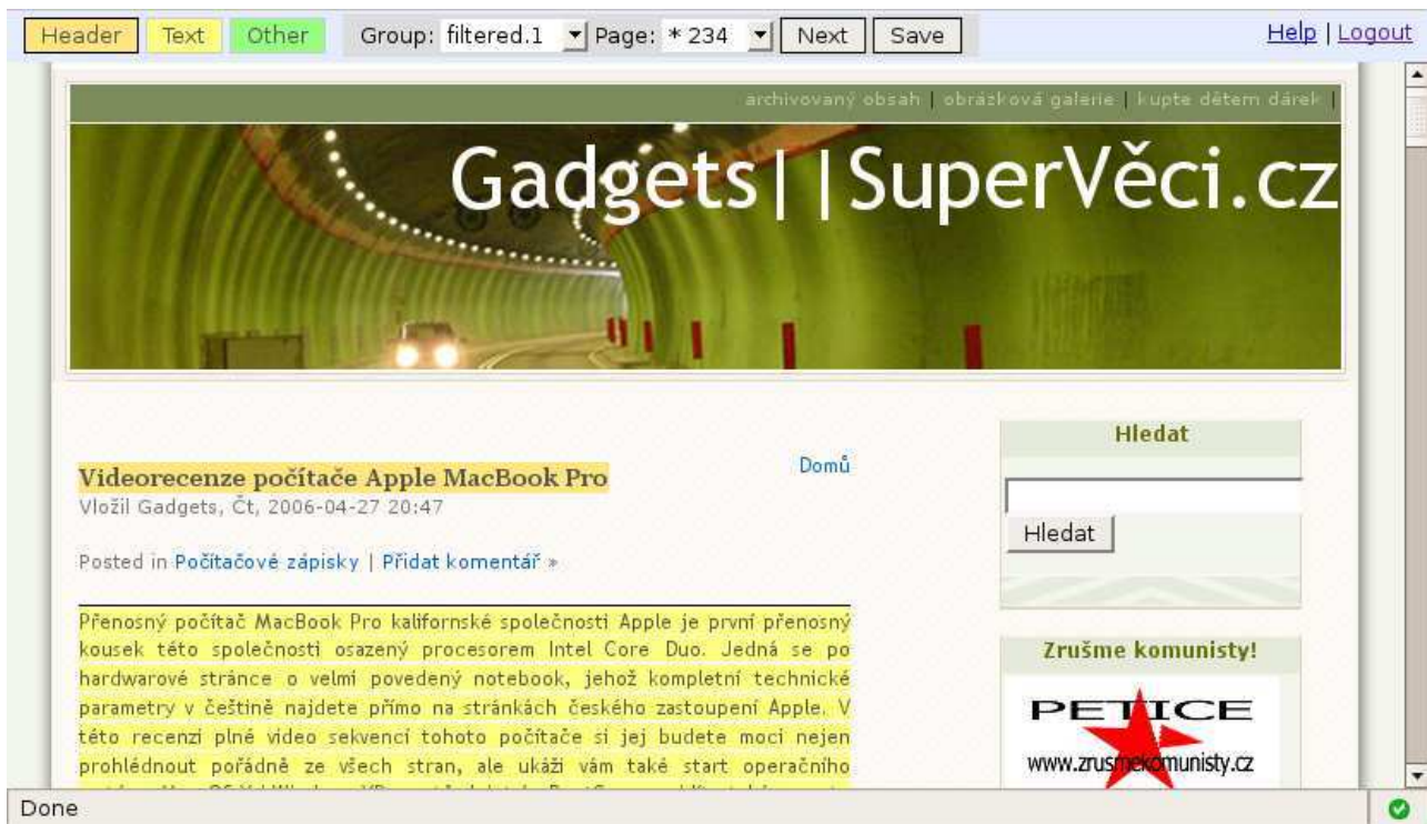
Figure 1: The annotation tool: browser window is split into two parts: narrow upper frame is used for annotation control, lower frame contains the page to be annotated. Current annotation is shown using different colors for every label.

judged and annotated — remaining unannotated blocks are implicitly classified as other . Our volunteer annotator was able to achieve speed of 200 web pages per hour.