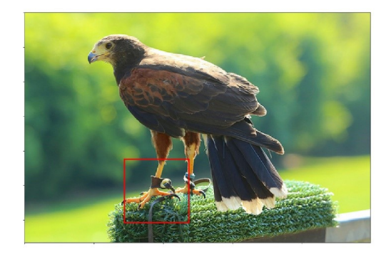
English Text: The sharp bird talon. Bengali Text: ধারালো পাখি টালন

Figure 1. A sample from the BVG dataset: an image with a specific region marked and its description in English and Bengali for text-only, multimodal and caption generation tasks.