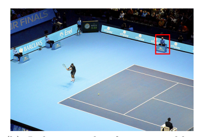
(b) Judge on side of court on blue platform.