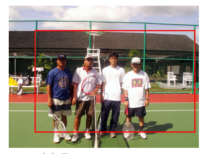
(a) Four men on court .