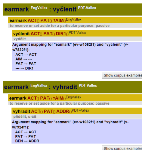
Figure 2: Two sense- and argument-aligned translations of earmark to Czech