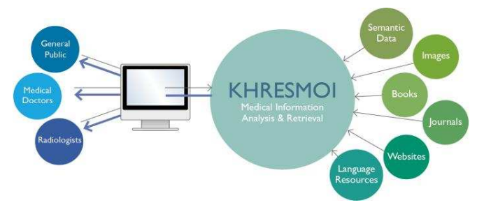
Figure 1 - The Khresmoi Concept

Copyright is held by the author/owner(s). HSD 2013 , August 1, 2013, Dublin, Ireland.