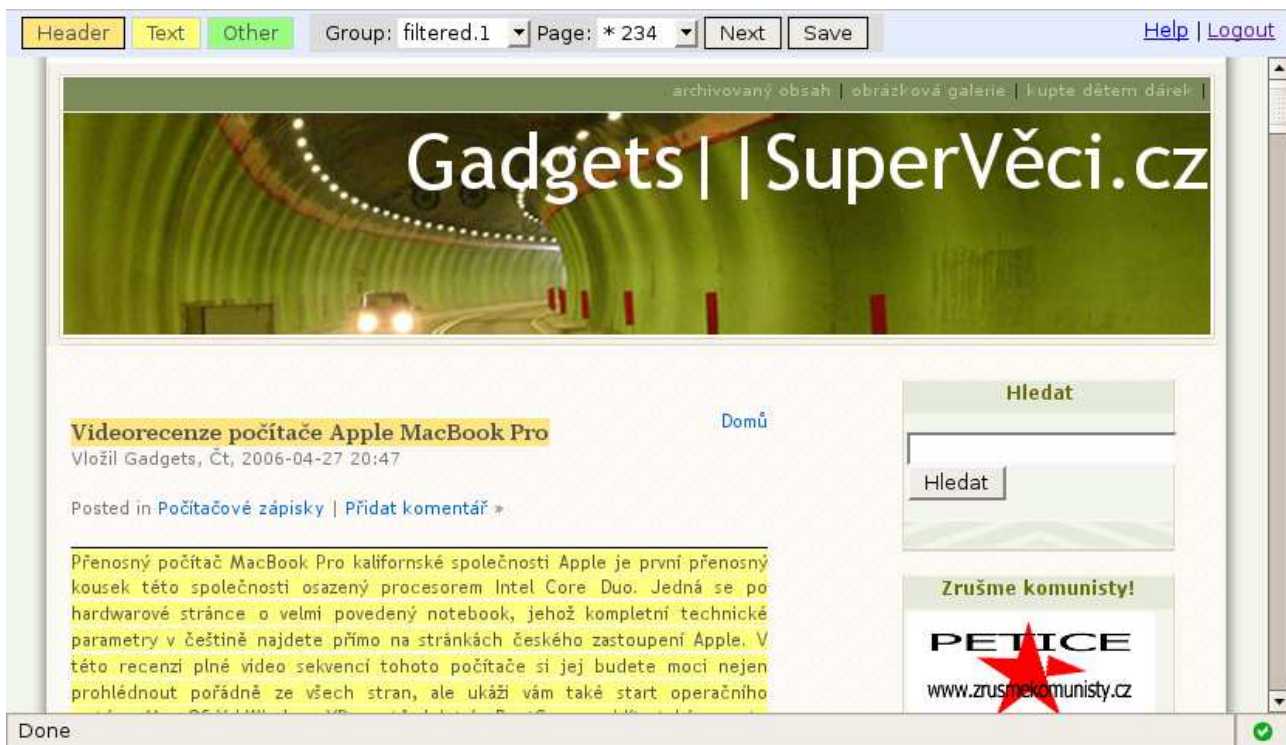
Figure 1: The annotation tool: browser window is split into two parts: narrow upper frame is used for annotation control, lower frame contains the page to be annotated. Current annotation is shown using different colors for every label.

judged and annotated — remaining unannotated blocks are implicitly classified as other . Our volunteer annotator was able to achieve speed of 200 web pages per hour.